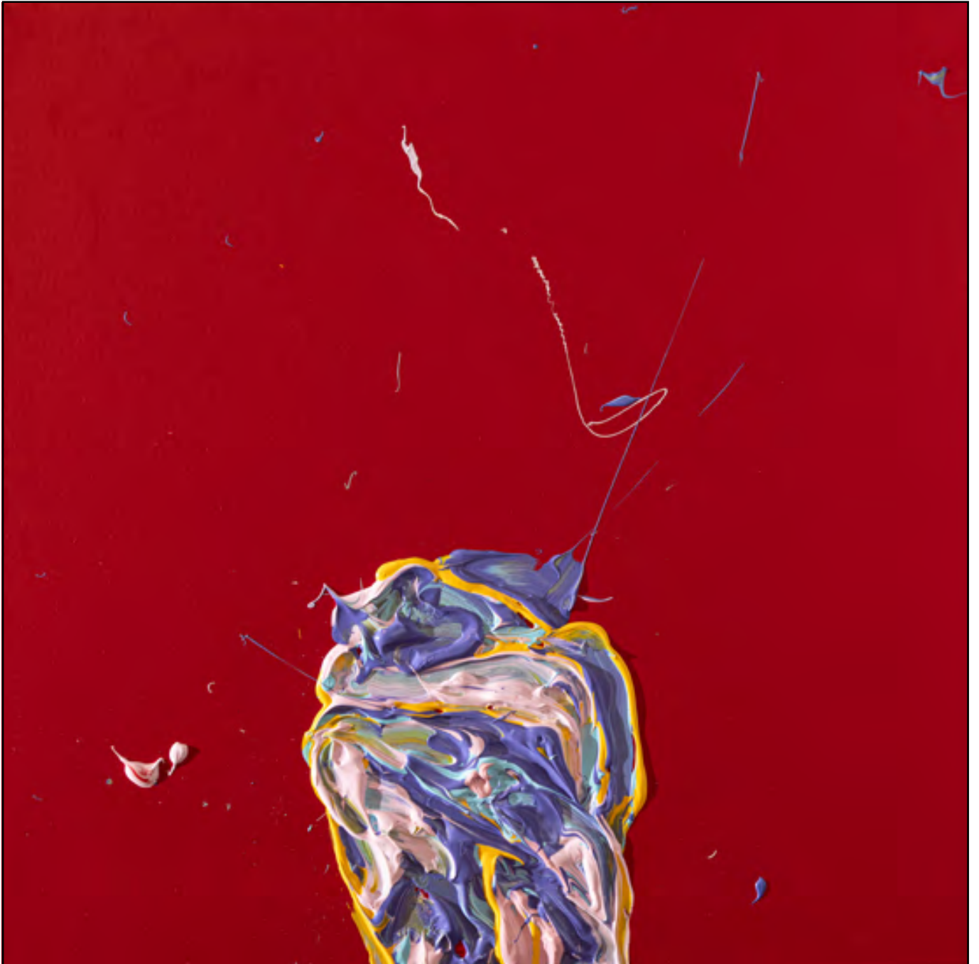
Small things Red like Love 3 - Acrylic on canvas - 80x80 cm - 2024

In this tension between presence and absence, one also perceives the artist's dialogue with his own experience of migration.