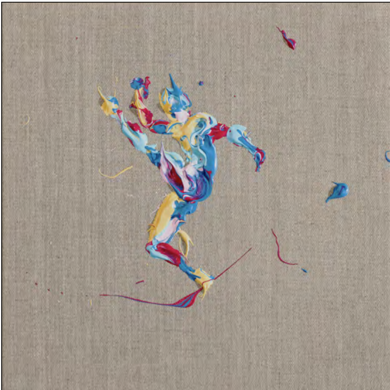
Small Things Nomos 5 - Acrylic on canvas - 30x30 cm - 2025

It is precisely this universal dimension that makes Bejarano's painting profoundly contemporary: an art that offers no definitive answers, but invites the viewer to recognise their own fragility in that of the other. Ultimately, his painting possesses a rare delicacy, capable of evoking silence.