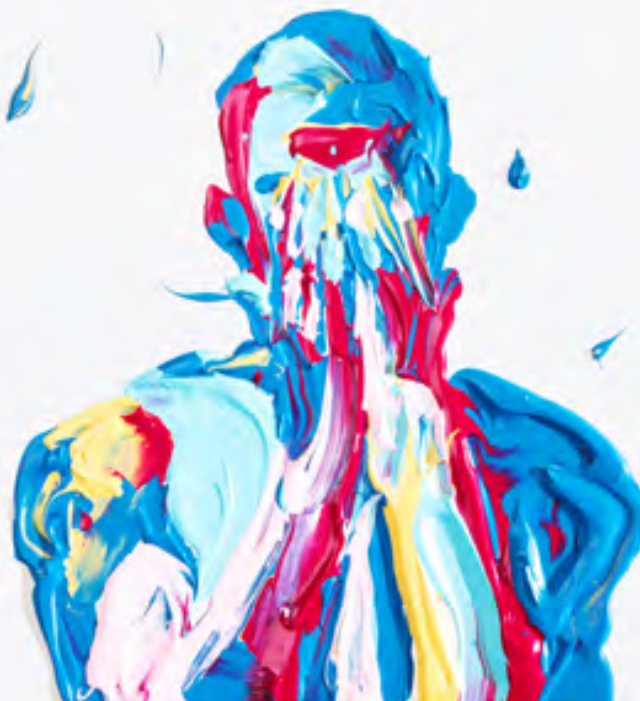
Small things Hidden emotions - Acrylic on canvas - 50x50 cm - 2025

His work is not limited to the representation of the human body, but explores the complexity of contemporary existence, questioning the relationship between identity, transformation and the desire for connection. His works seem to exist in a suspended space, where the image manifests itself and yet simultaneously eludes us, leaving the viewer with the sensation of witnessing something incomplete, fragile and profoundly human.