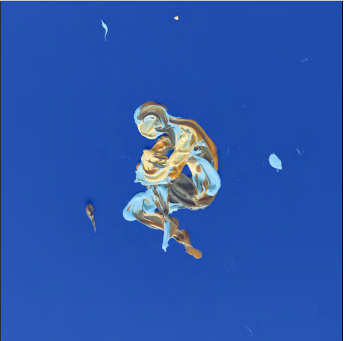
Small Things Into the blue - Acrylic on canvas - 50x50 cm - 2025

This choice is not merely aesthetic: the artist seeks to represent the human being as a reality that is never complete, as an identity in constant transformation. His figures become a metaphor for an unstable era, in which contemporary man struggles to fully recognise himself.