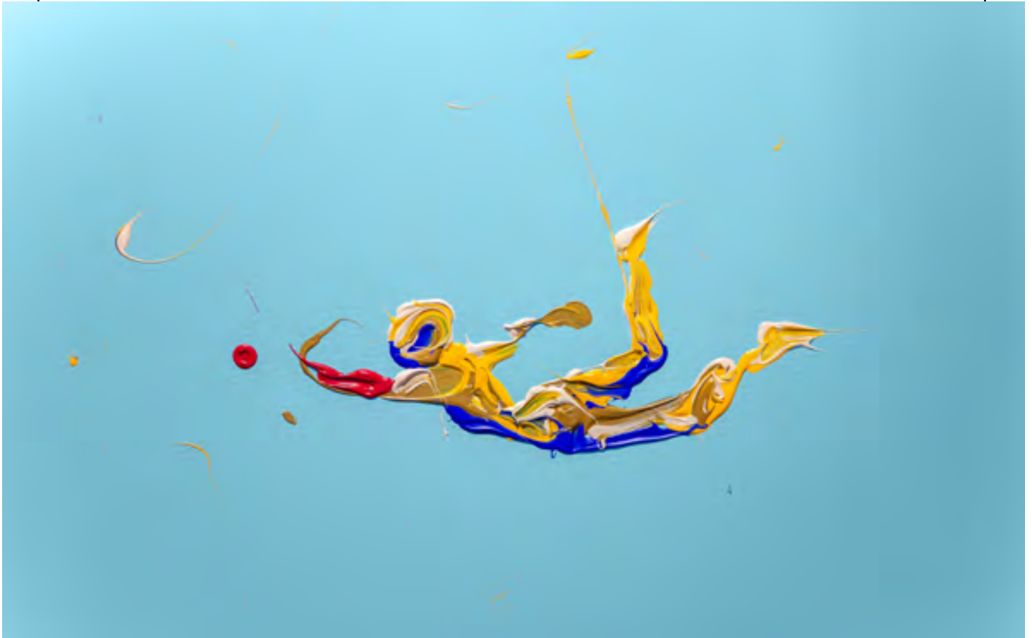
Between the sky and void - 2026 - detail

The figures exist, but are never rigidly defined; abstraction intervenes as a space of freedom, dissolving boundaries and allowing the material to transform into visual emotion.